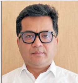
Pabitra Margherita Minister of State for Textiles, Govt. of India

IFJAS 2024 presents an excellent opportunity for Indian exporters and artisans, to exhibit their products and establish significant international alliances. It will be truly inspiring for overseas buyers to see Indian fashion product manufacturers embracing eco-friendly and ethical practices which not