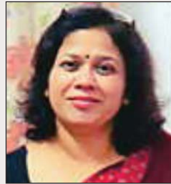
Amrit Raj, IPOS Development Commissioner (Handicrafts), Ministry of Textiles, Govt. of India

India is emerging as an incredibly coveted hub propelled by its rich array of offerings, proficient artisans, and boundless potential. Crucially, this event plays a pivotal role in cultivating a vibrant marketplace for the sector, benefiting a multitude of craftspeople and marketers alike. This is an important event to create a market for the sector that involves a large number of crafts persons. The