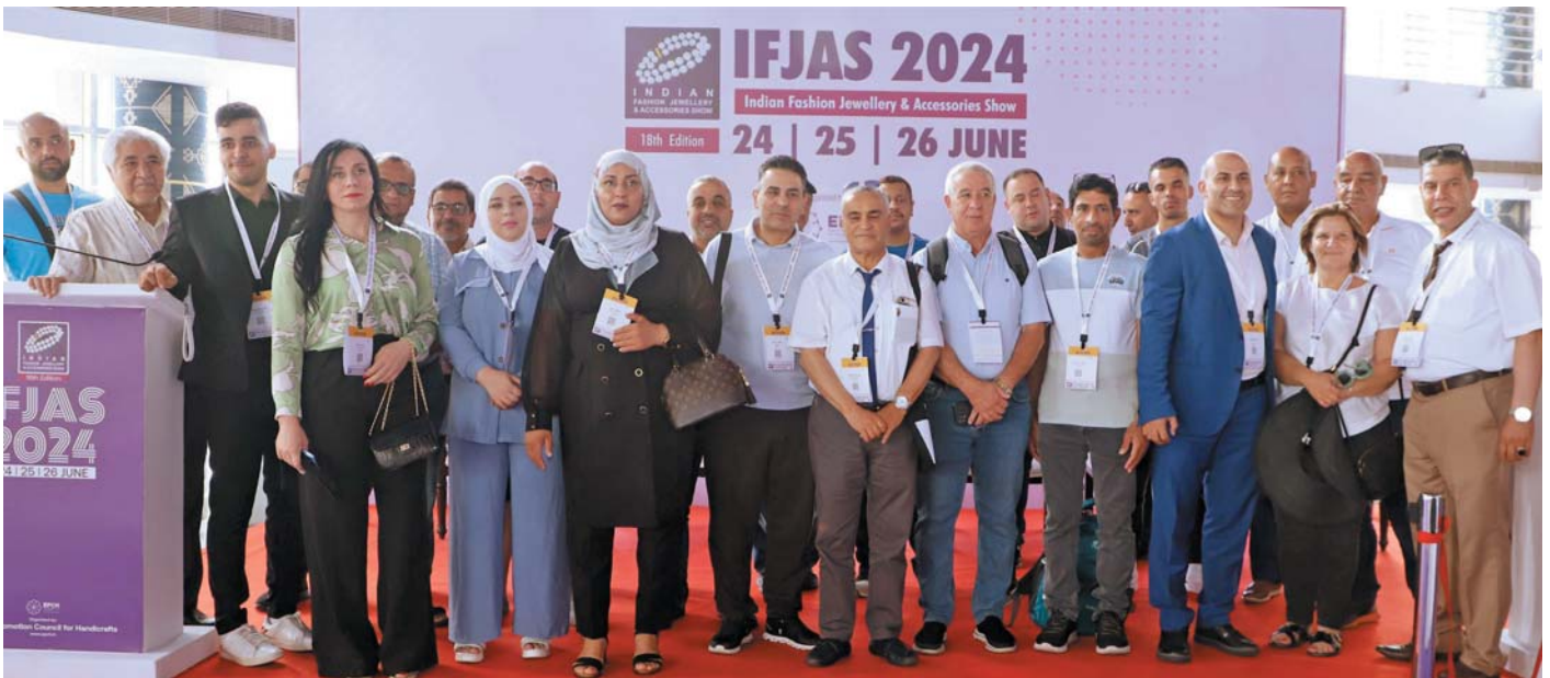
A delegation of buyers from South Africa, Middle East and CIS nations the IFJAS 2024 inauguration