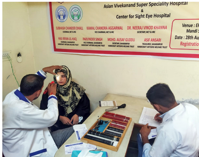
The camp saw an overwhelming response, with over 200 patients benefiting from the services